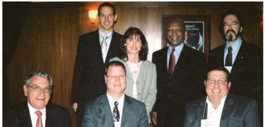
NATO Theatre Promotions — Secretary of State Jesse White hosted a luncheon for members of the National Association of Theatre Owners who partnered with the office in April to promote organ/tissue donor awareness. Approximately 900 Illinois theater screens owned by members of the organization aired the organ/tissue donor public service announcement free in an effort to spread the donor message to the theater-going public.

Other winning Secretary of State entries at the AAMVA regional level included the "You Decide" brochure and the "She Counts on You Too..." poster.