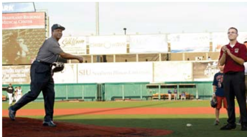
Secretary of State Jesse White throws out a pitch at a Marion Miners baseball game during the annual donor night at Rent One Park in Marion.