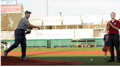
Secretary of State Jesse White throws out a pitch at a Marion Miners baseball game during the annual donor night at Rent One Park in Marion.