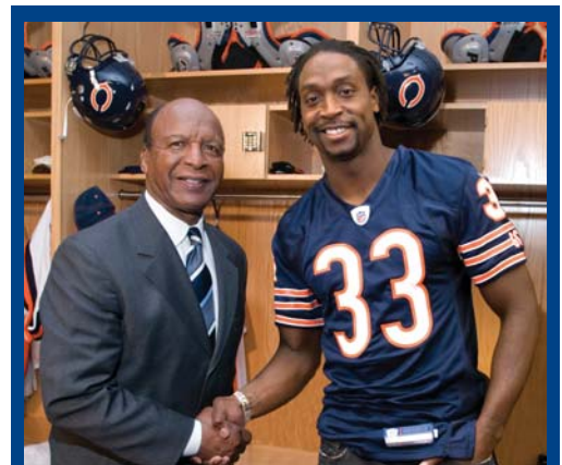
Secretary of State Jesse White and Chicago Bears cornerback Charles Tillman following shooting of the new donor commercial in the Bears' locker room at Soldier Field.

Seven children under age 1 are waiting for transplants in Illinois. Six wait for a liver, one waits for a heart.