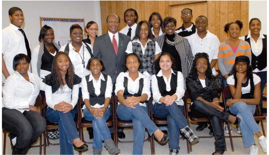
Secretary of State Jesse White with the vocal group “Generation of Destiny” from Church of the Living God Temple, which performed at Peoria’s Zion Baptist Church during the National Donor Sabbath in November.