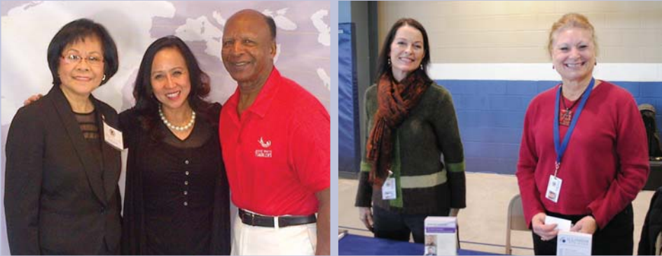
ABOVE LEFT: Secretary of State Jesse White meets with members of the Asian-American Coalition of Chicago at their 32nd Annual Conference on Business and Networking hosted by the Indonesian-American Community at the Hyatt Regency O'Hare in Rosemont in February.