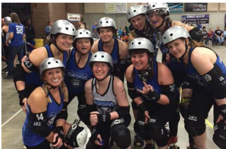
The Prairieland Punishers Roller Derby team from Decatur thrilled a crowd of more than 600 as they helped the Macon County Life Goes On Committee kick off National Donate Life Month at the Decatur Civic Center in March.