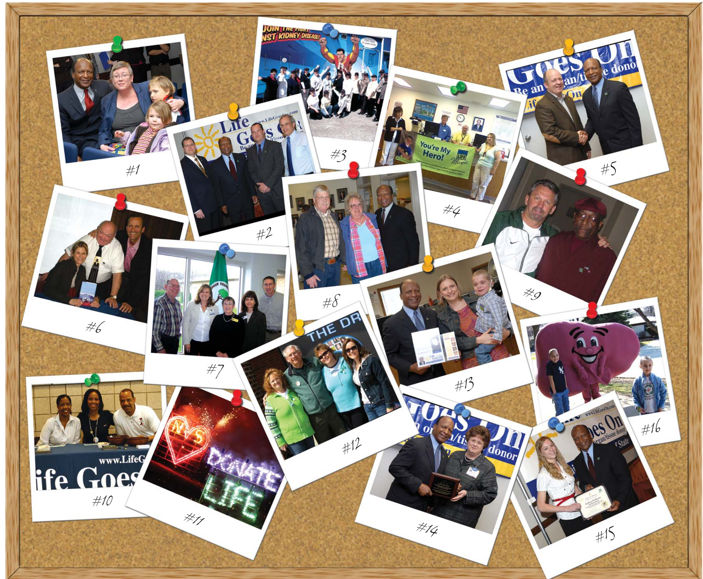
Photo #16 – "Morgan D'Organ" made an appearance at many donor events in April, including Glen Ellyn Donor Days.